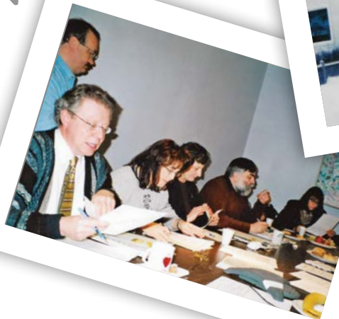
January 2002 Council Meeting

As fall comes to a close, I wish you a happy holiday season and the best in the new year.