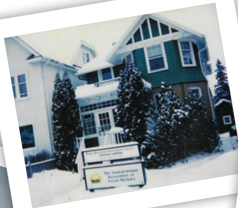
Previous Office 2341 McIntyre St. ← Regina