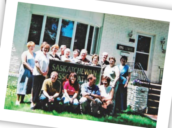
June 2002 Advisory Board